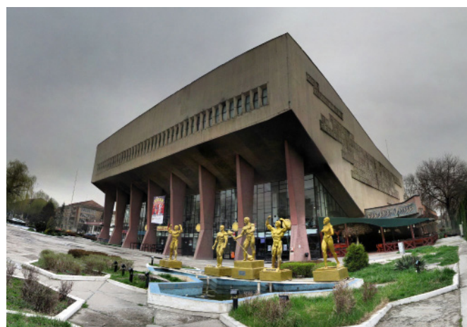
Constantin Jude Sports Hall

Address: Sala Olimpia, Alea F. C. Ripensia 7, Timișoara